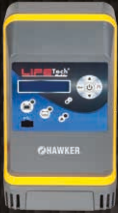
1-PHASE Lifetech™ CHARGER

Find out more about our products and services at www.enersys.com