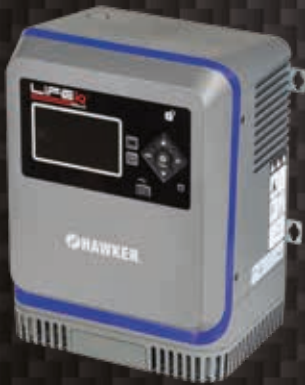
1-PHASE LifeiQ™ CHARGER