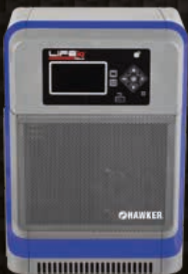
3-PHASE LifeiQ™ CHARGER