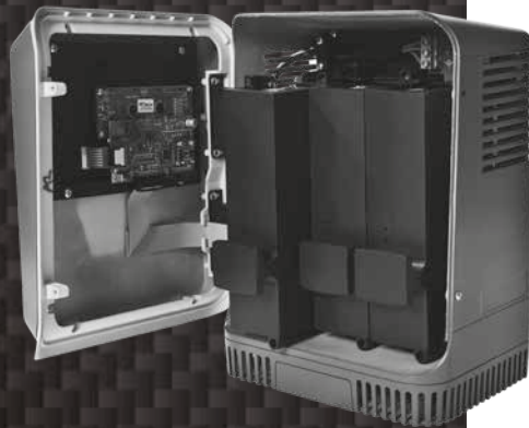
1-PHASE 3 BAY CABINET INTERIOR