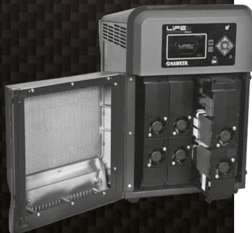
3-PHASE 4 BAY CABINET INTERIOR