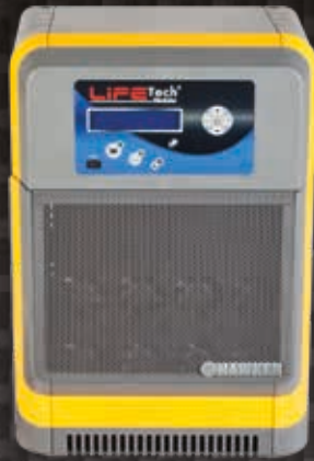
3-PHASE Lifetech™ CHARGER